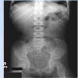
Abdominal radiograph of constipated child showing stool throughout the colon